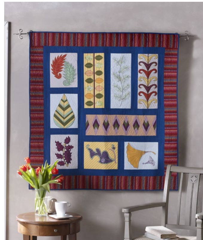
Finished Wall Hanging